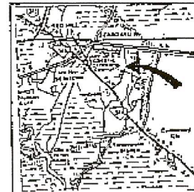
LOCATION MAP 11A. - 201.